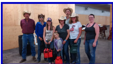
Webster Trail Riders Largest Team & Highest Fundraising Team