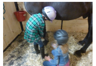
Grooming & Horse Care